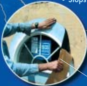
Protecto Flex Flashing Tape