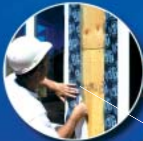
Protecto Wrap BT20XL